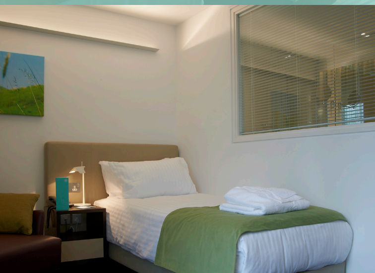
Standard single room