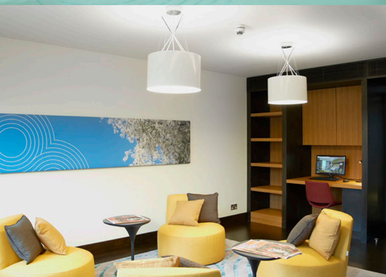
The hotel's communal living room – Cotton Cove