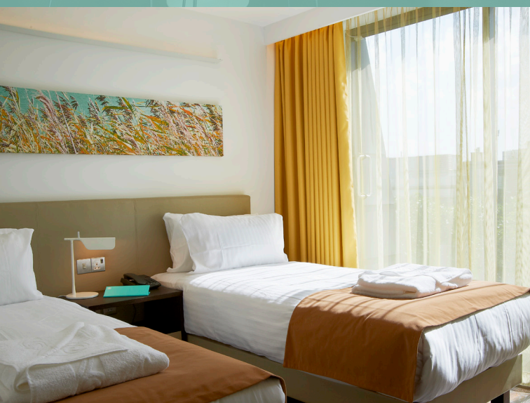
Standard twin room