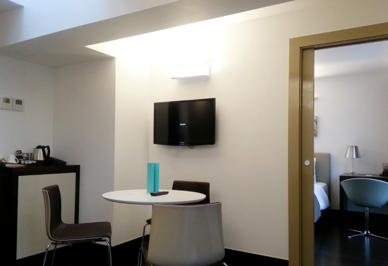
Self catering junior suite