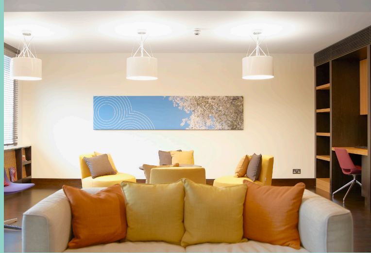
The hotel's communal living room – Cotton Cove

Patients who are suited to this type of care will be offered the opportunity to stay in the hotel by the clinical team treating them. Their hotel stay will be arranged by their clinical team.